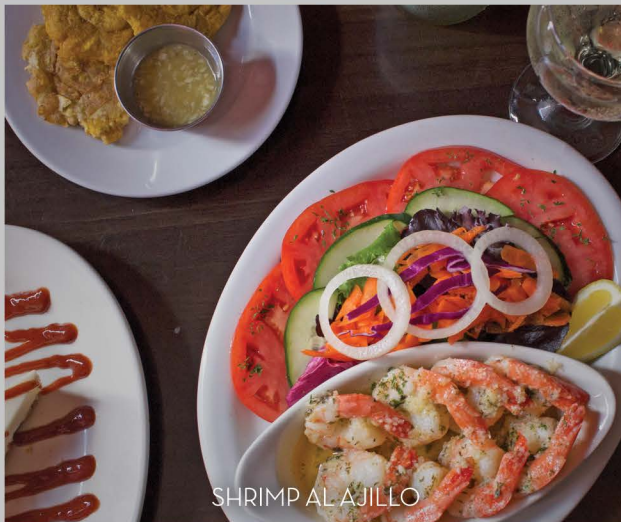
SHRIMP AL AJILLO