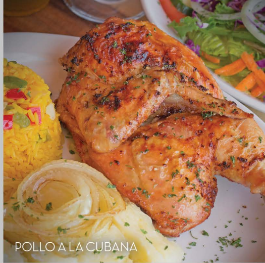
POLLO A LA CUBANA